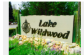
Sewage Overflow in Lake Wildwood