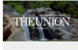
Nevada City set to celebrate 162nd birthday